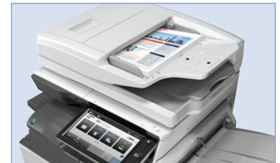
Sharp's ImageSEND™ feature provides one-touch distribution to email, cloud applications and more.